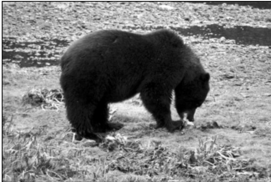
Bears at Pack Creek frequent Swan Cove which is only 6 miles away.

ACT NOW! A strong public outcry can stop proposals to open up Swan Cove and Swan Island to bear hunting. Send comments to the Board of Game. Include specific reasons for opposing Proposals #13 & #15. Letters should be received by 5:00 p.m. October 27th.